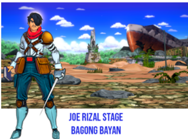
JOE RIZAL STAGE BAGONG BAYAN

All stages in the game is based on real locations in the Philippines where each stage has significant relation to the game characters and their real life inspirations.