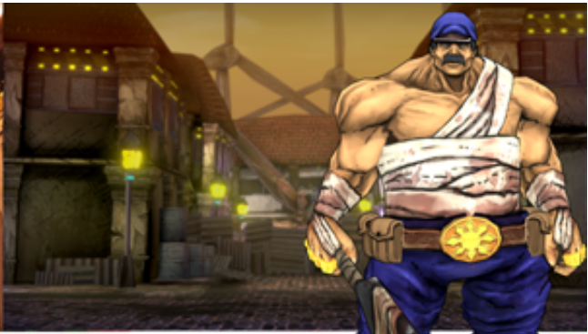
GEN. TONIO LUNA STAGE VIGAN