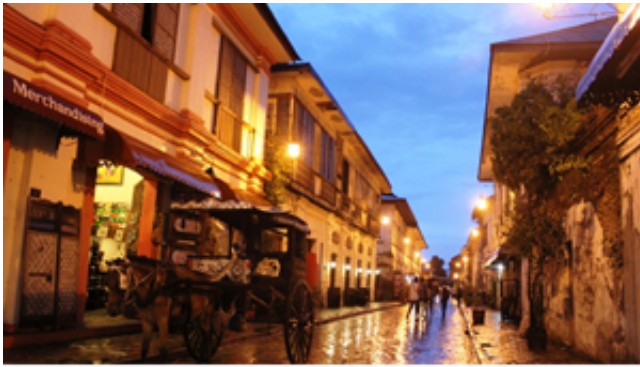
CALLE CRISOLOGO - VIGAN CITY PHILIPPINES