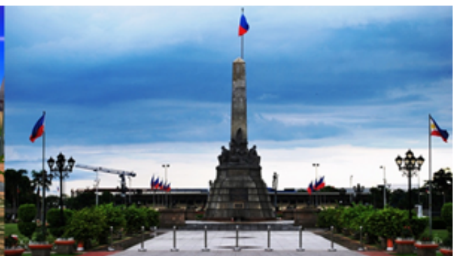
BAGUMBAYAN LUNETTA PARK PHILIPPINES